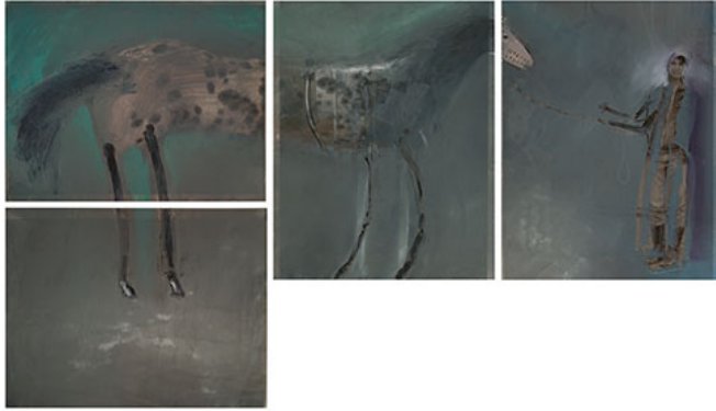
Woman with Spotted Horse