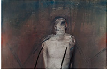
Young Man Sitting Down